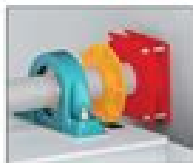
High Temp Style Pedestal with Shaft Cooler & Stuffing Box or Mechanical Shaft Seals