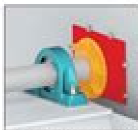
High Temp Style Pedestal with Standard Shaft Seal & Cooler