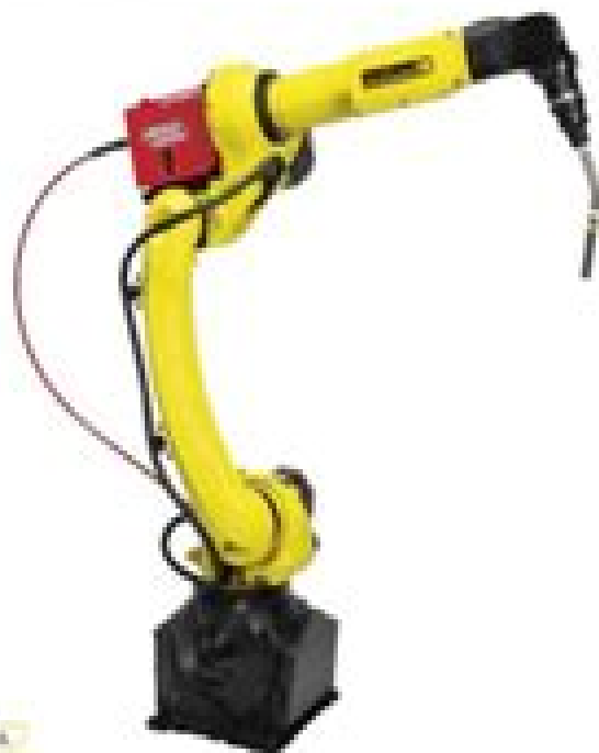
ARC Mate 100iD/10L Long arm, hollow wrist