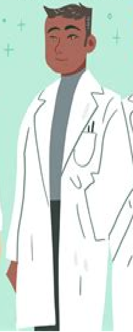
Fellow (Physician pursuing post-residency training)