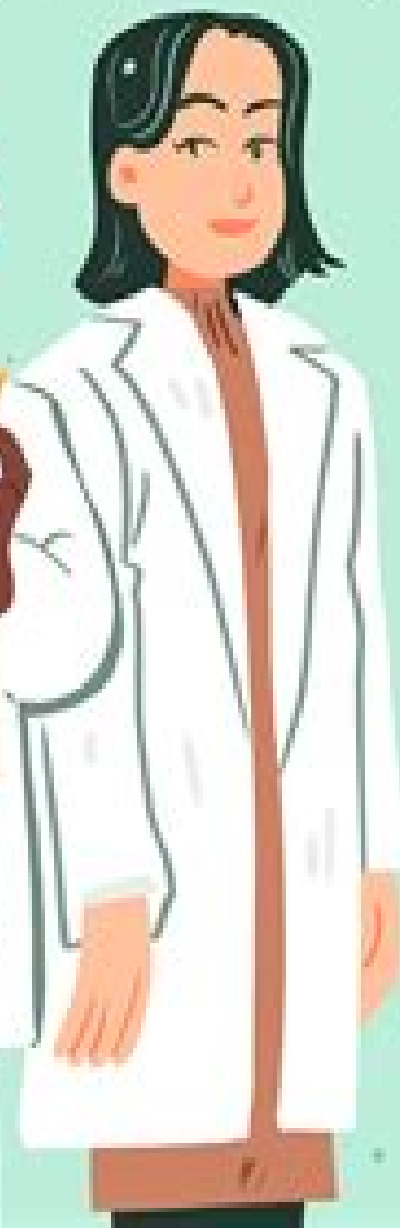
Resident (Physician pursuing 2-7 years of specialized training)