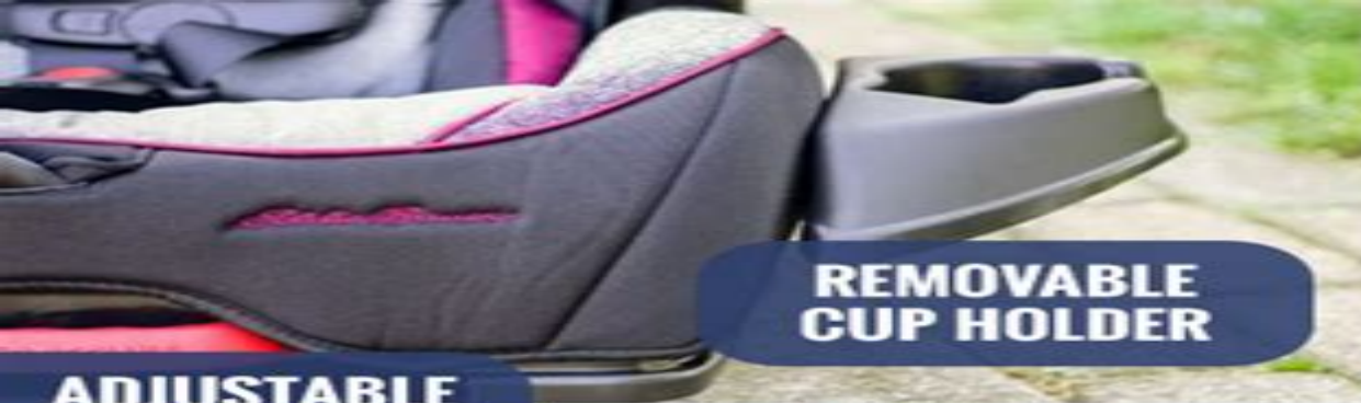
REMOVABLE CUP HOLDER