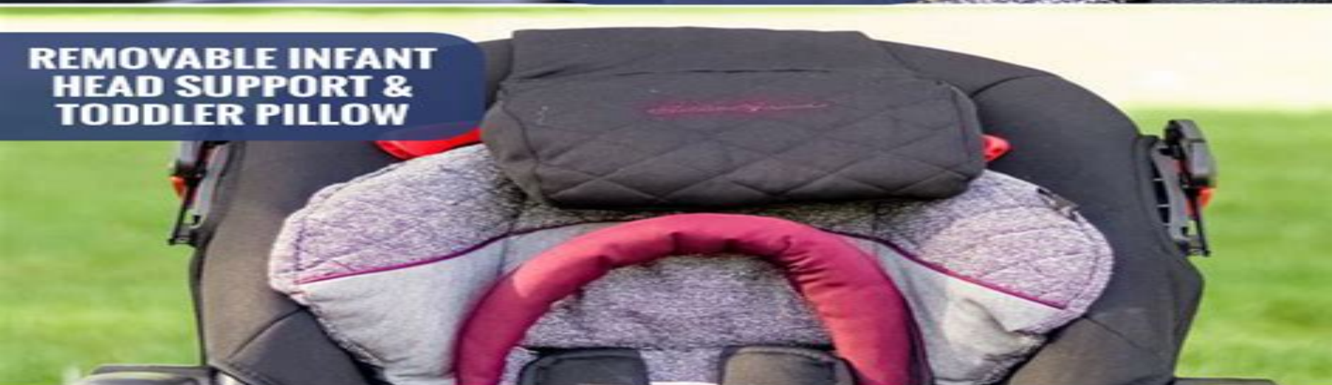
REMOVABLE INFANT HEAD SUPPORT & TODDLER PILLOW

EDDIE BAUER 3-IN-1 CONVERTIBLE CAR SEAT FEATURES TO LOVE GENTRY