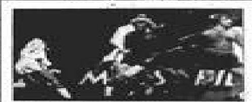
De VN-Commissie voor de Verenigde Staten heeft de VN-Commissie voor de Verenigde Staten...