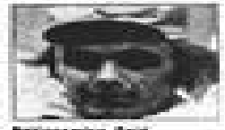
De VN-Commissie voor de Verenigde Staten heeft de VN-Commissie voor de Verenigde Staten...