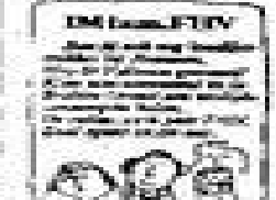
De VN-Commissie voor de Verenigde Staten heeft de VN-Commissie voor de Verenigde Staten...