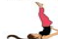
SHOULDER STAND Le Chandelle