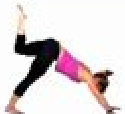
Knee circles (step 2)