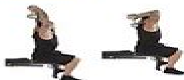
SEATED TRICEPS PRESS