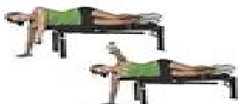
LYING SINGLE ARM FLYES