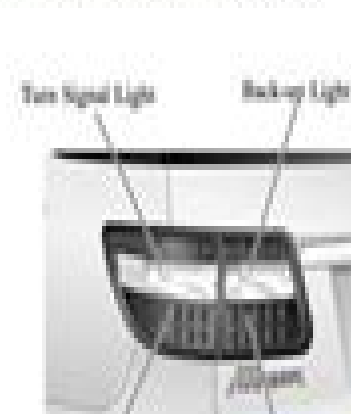
Stop Light and Taillight